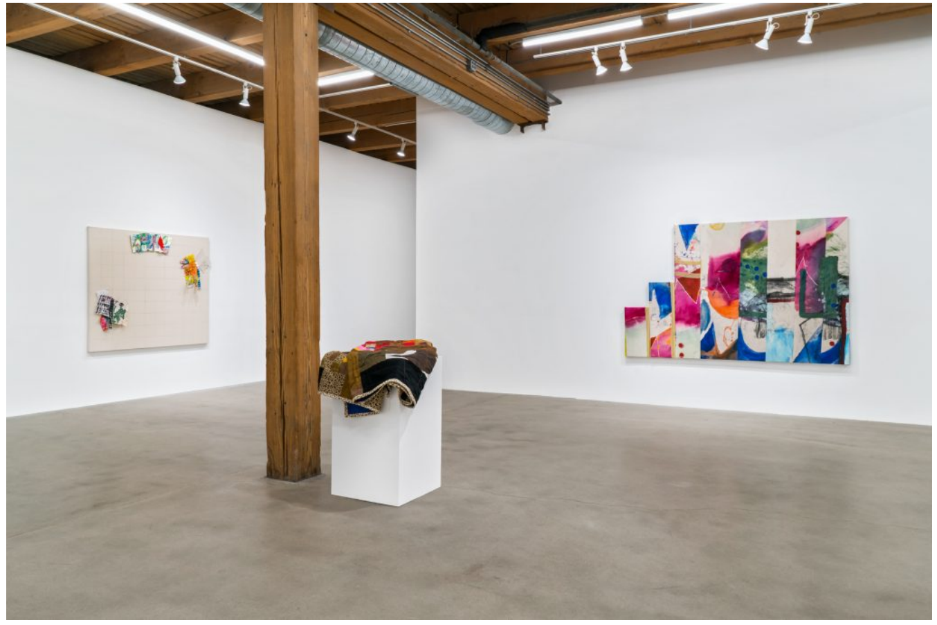
Installation view, Molly Zuckerman-Hartung "Flim Flam," Corbett vs. Dempsey