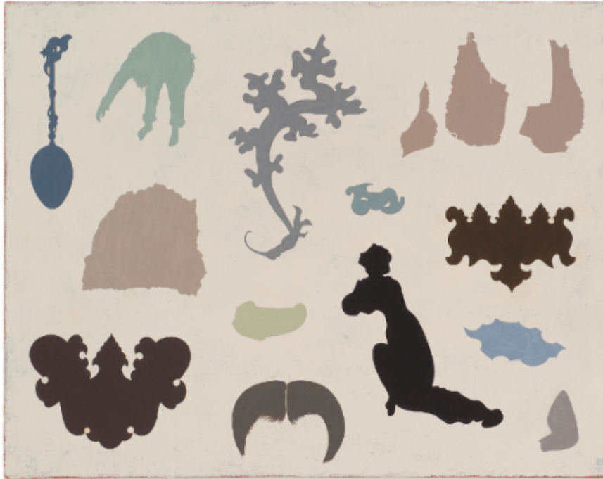
Rebecca Shore | 2011-01 , 2011, oil on canvas on panel, 11 x 14 inches

images in the painting. Each shape, whether it be a figure from Chinese wallpaper or an uninterpretable blob traced from a TV screen-shot, has to meet the painting's organizational standard. The game is to figure out what the organizing principle might be.