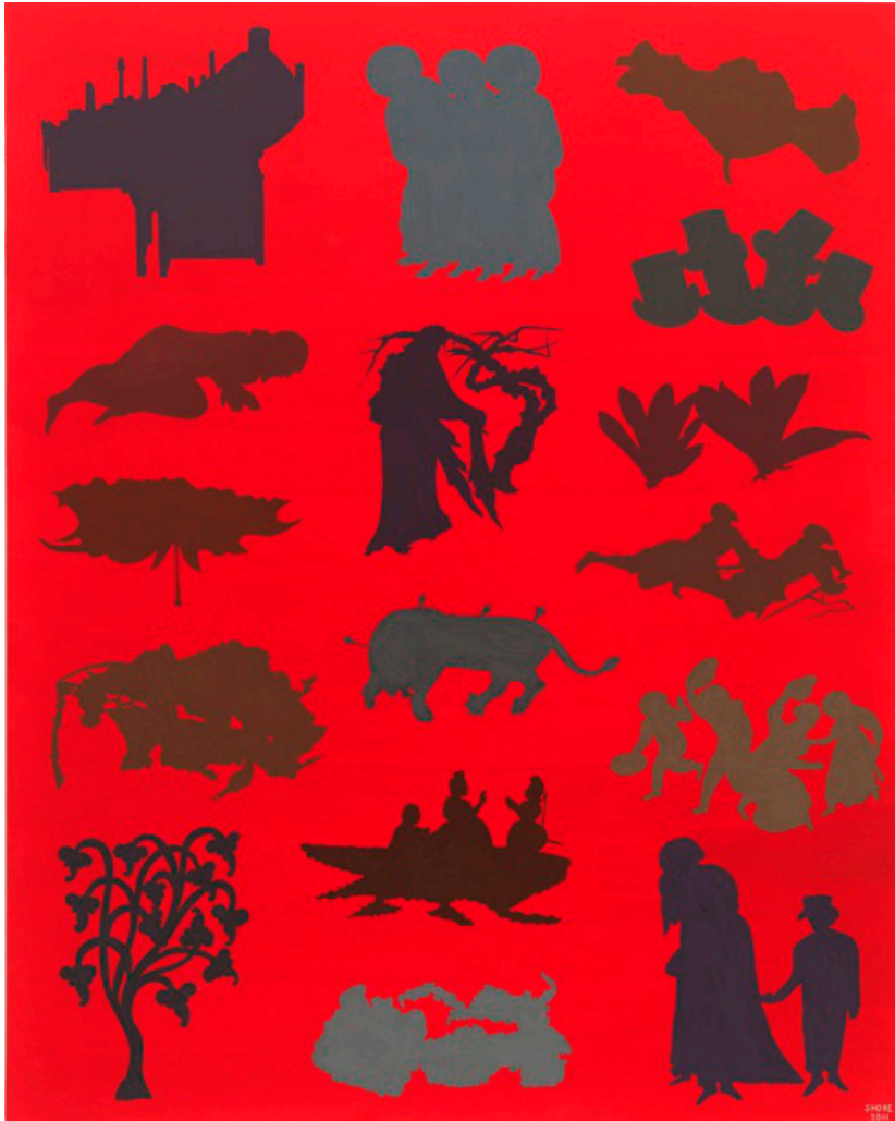
Rebecca Shore | 2011-16 , 2011, distemper on panel, 31 x 25 inches

In the interview section of the exhibition catalog, Shore says, “I try to make an arrangement where things relate to one another in a way that allows you to experience them without being confused[...] You’re urged to make relationships through form, but your questions about identity are often not answered.”