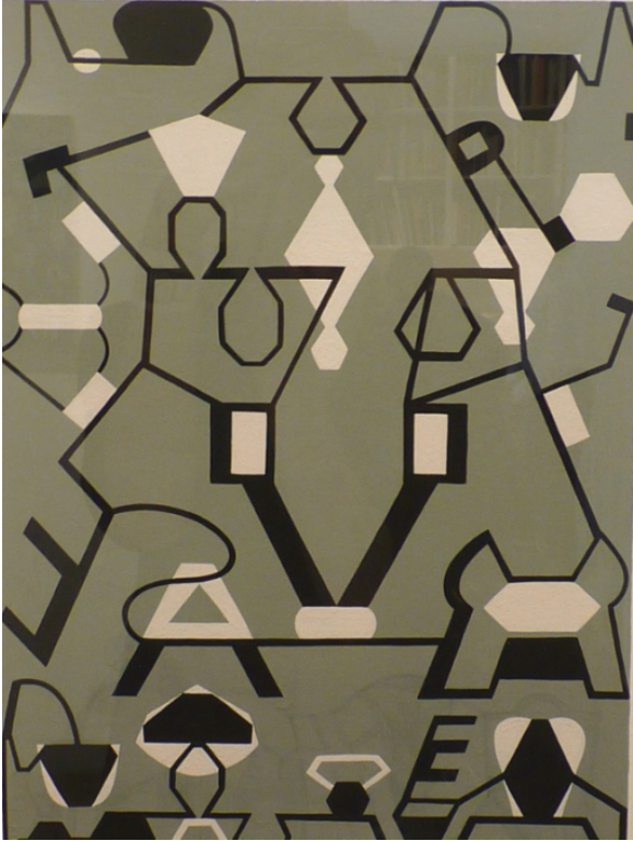
Rebecca Shore | 2009-20-G , detail, 2009, gouache on paper, 14 x 10 inches

Shore's process is rooted in an intellectual framework, but the paintings are also traditionally beautiful objects. A nuanced handling of the materials is apparent in the subtle brushwork and delicate variations of paint transparency. These works are made with a variety of media: gouache, oil, distemper (a paint using rabbit skin glue as the binder), acrylic, and egg tempera with casein. These subtleties are appealing, but her technique is not so lush that it detracts from the conceptual push/pull of the imagery. Shore manages to balance cool and detached humor with a genuine fondness for the formal qualities of painting. She clearly loves sifting through a variety reference materials until she finds a combination that intuitively make sense to her. This work is worth seeing and spending some time with.