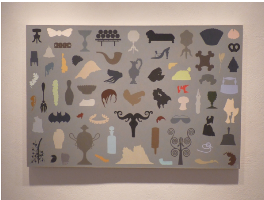
Rebecca Shore | 2010-10 , 2010, oil on canvas, 30 x 45 inches